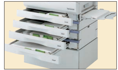
AR-M207E shown with optional paper trays, for a total online paper capacity of 1,100 sheets.

Add powerful fax functionality to the AR-M162E/M207E with the Super G3 fax module. With 350 Auto-Dial numbers and Broadcasting Capability up to 200 destinations, the AR-M162E/M207E IMAGERS can easily handle high-volume faxing environments.